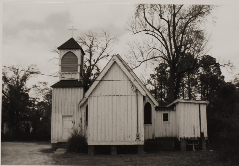
Dorchester County Archives and History Center