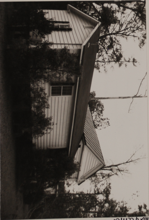
— Dorchester County Archives and History Center